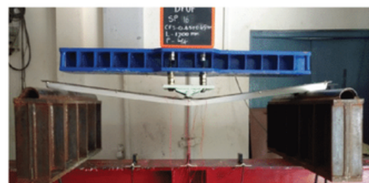
Figure Caption: Development of Light weight flooring system